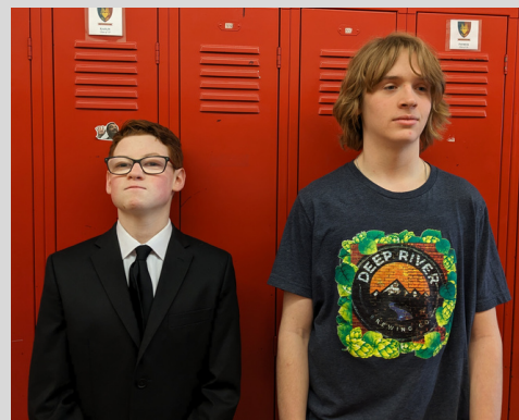
Formal and Normal