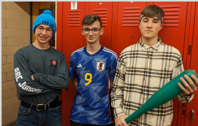
About-to-get-sued, Japanese dude, and Bad attitude