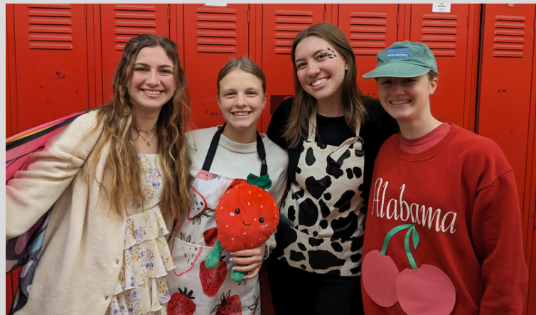
Fairy, Berry, Dairy, and Cherry