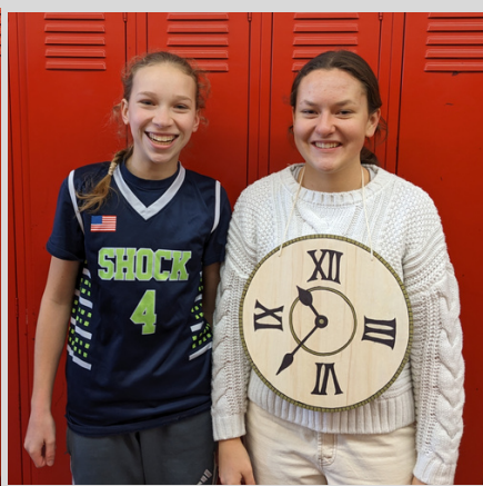
Shock and Clock