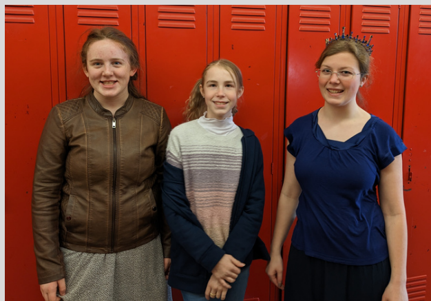
Brown, Crown, and Nervous breakdown